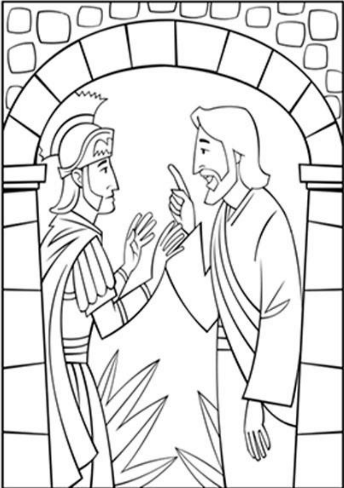
Jesus and the Centurion. (Matthew 8:5-13)