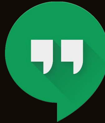
Google Hangouts Meet